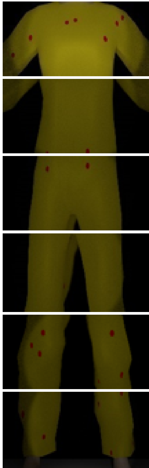
Figure 6. The full-body suit subdivided into six areas: chest, abdomen, pelvis, thighs, lower legs, and ankles.