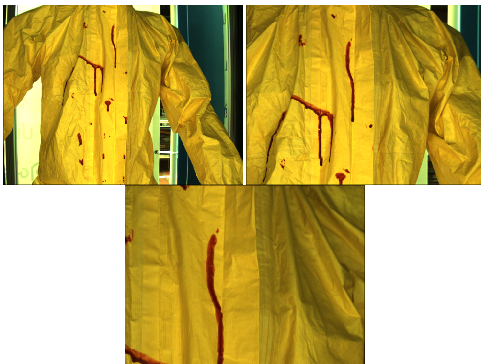
Figure 7. Physical emulated dataset respectively with different zoom levels: the ( upper left ) image represents 4.88 mm of focal length (0% zoom), the ( upper right ) image corresponds to 31.92 mm focal length (60% zoom), and the ( bottom ) image with focal length of 57.6 mm (100% zoom).

The acquisition of images with physical emulation of blood stains was performed on a real PPE suit using a proprietary blood simulant and the actual full-body scanner mechanism of Figure 4. Images were obtained utilizing the system's single monocular camera surrounded by four high intensity LED lamps and different camera focal length from 4.8 mm (0% zoom) to 57.6 mm (100% zoom) (Figure 7). The total time required for the acquisition was 19.23 min, dominated by camera movement times such that actual camera acquisition times are depreciable. This second dataset is composed by a larger number of images at higher resolution and a larger proportion of stains: 47 images of 1280 \times 960 pixels, where stained areas represent a 2.25% of the total of 57,753,600 pixels.