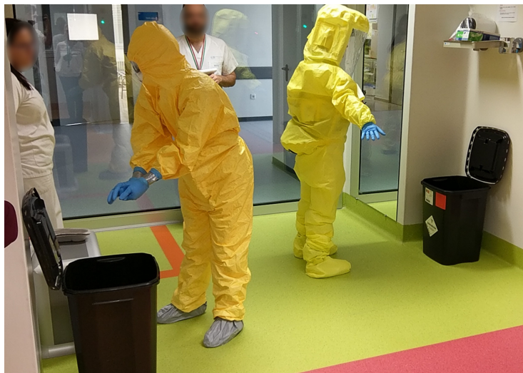
Figure 1. Removal and disposal of gloves inside the changing room (during training session).

The removal task involves several steps. During this activity, the actuation protocol states [11]: “We will always act slowly, calmly, being aware of our body and proceeding with slow but precise movements. Even feeling that we are accustomed to this activity, we will never stop listening and attending to the indications of the instructor-observer, which will indicate to the personnel the sequence for the removal of the PPE”. The first pair of gloves, as well as the first pair of boot covers, are discarded in the patient’s room. Gloves are always disposed, while other components are stored for their posterior sterilization and reuse. Once in the changing room, the steps that must be followed are reported in order: (1) remove the second pair of boot covers; (2) remove the second pair of gloves; (3) open the front closure of the suit; (4) remove the suit head cover, remove the suit arms and legs, remove completely and roll it up for storage; (5) remove the third pair of gloves; (6) perform first-hand hygiene; (7) put on a new pair of gloves; (8) remove the waterproof glasses; (9) remove the FFP3 mask; and (10) remove the new pair of gloves [11]. Figure 1 illustrates the removal of the second pair of gloves once inside the changing room.