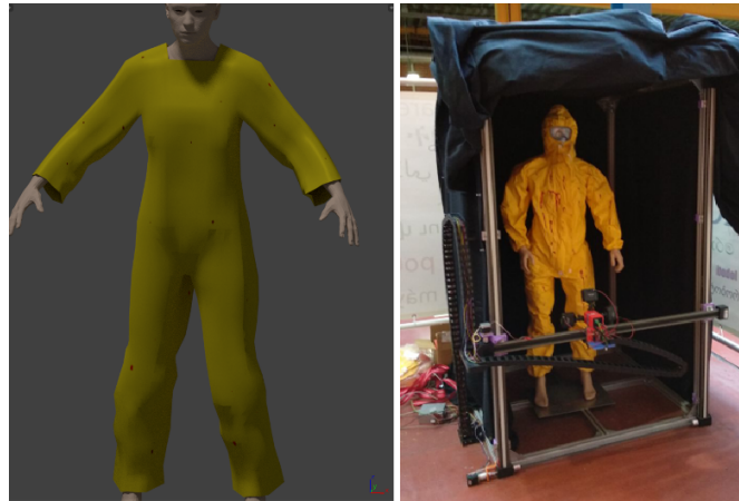
Figure 4. Comparison between the PPE suit of the simulated environment ( left ) and the physical PPE suit in the actual full-body scanner mechanism ( right ).

The study involved an initial analysis on a synthetic image dataset, followed by an additional study on an image dataset of the PPE with a physical emulation of blood stains taken by a real prototype. Figure 4 illustrates the simulated PPE suit and the physical PPE that were used for our investigation. The datasets have been openly published as a specific complement of this work [58].