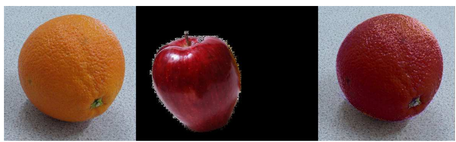
Figure 3: On the left side: an orange. In the center: an apple. On the right side: an orange recolored like an apple.

Some results of our proposal are shown in Fig. 3, Fig. 4 and Fig. 5.